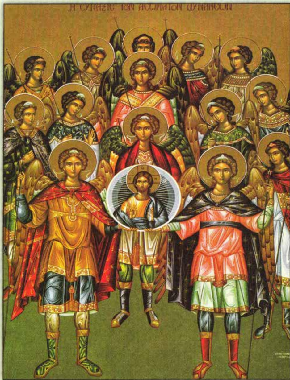
Icon of Saint Michael and all the Angels -- November 8th