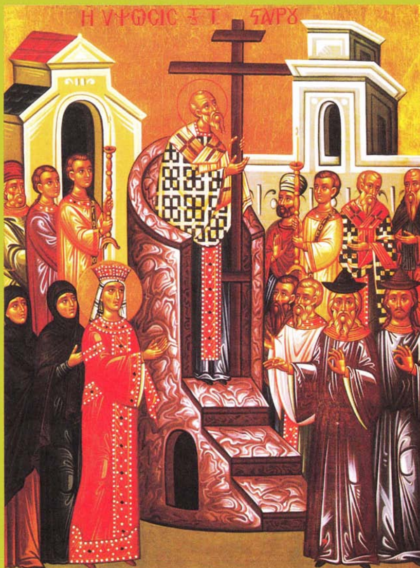
Icon of the Exaltation of the Holy Cross