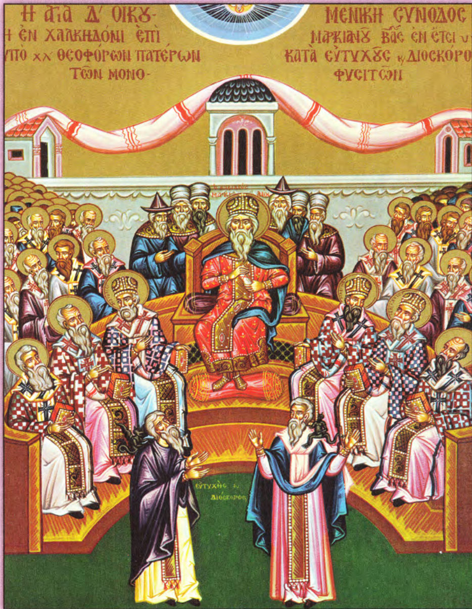
Icon of the Fathers of the First Six Ecumenical Councils