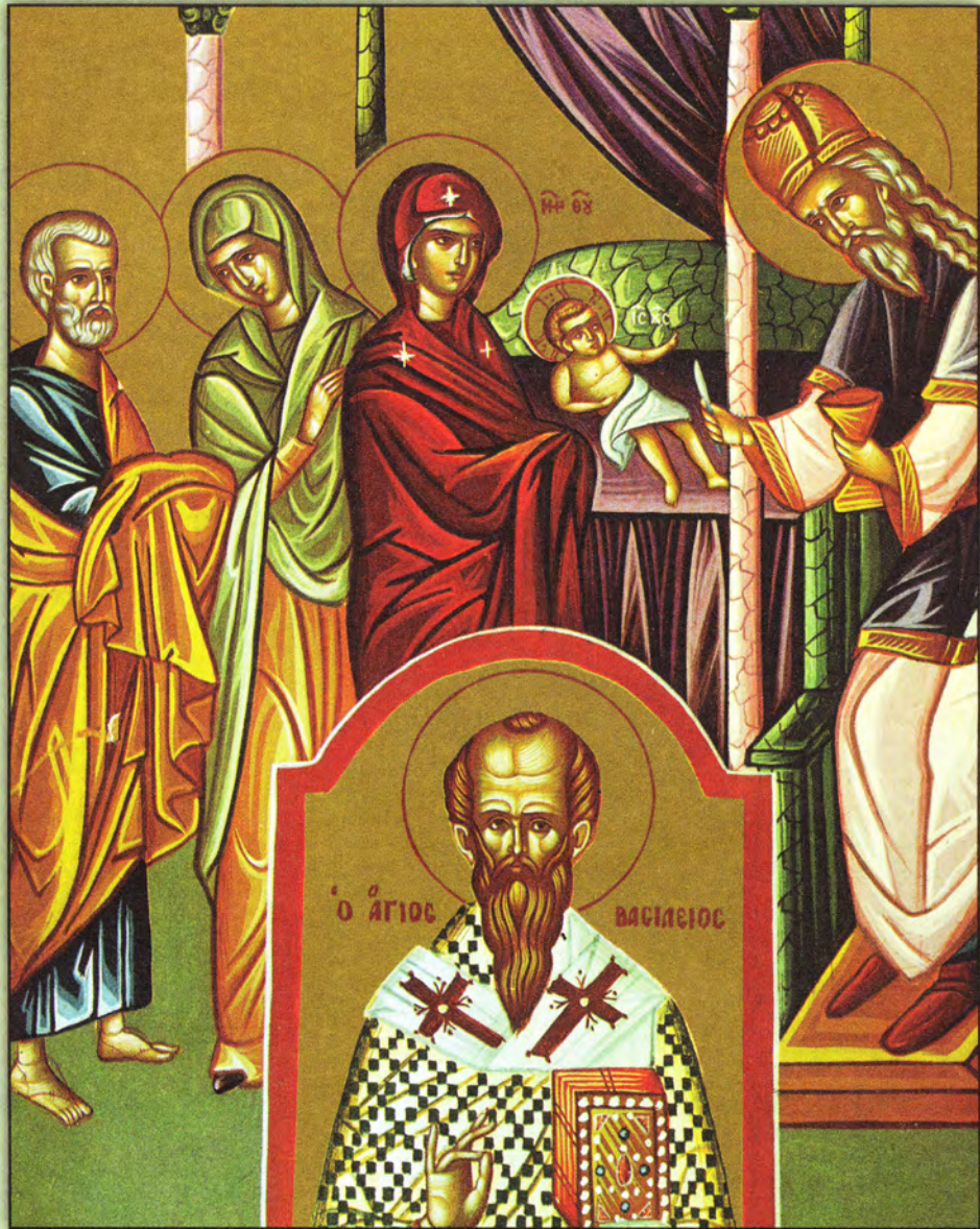
Icon of the Circumcision and Saint Basil the Great -- January 1st