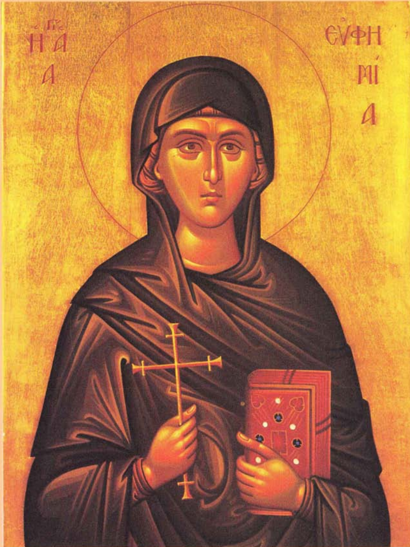
Icon of Saint Euphemia -- July 11th