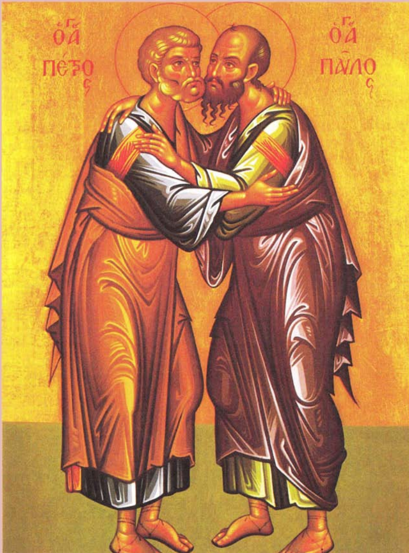
Icon of Saints Peter and Paul -- June 29th