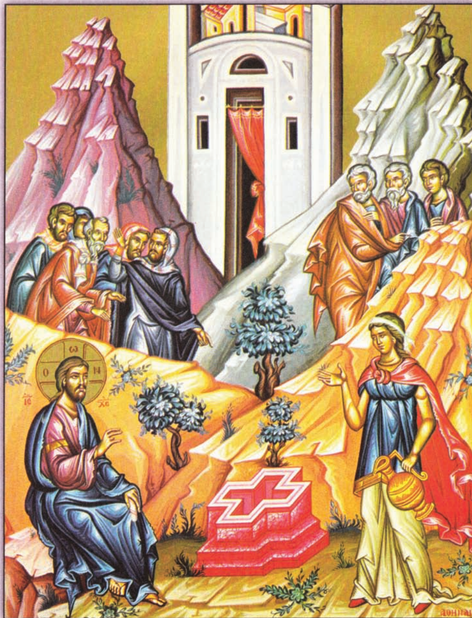
Icon of Christ and the Samaritan Woman