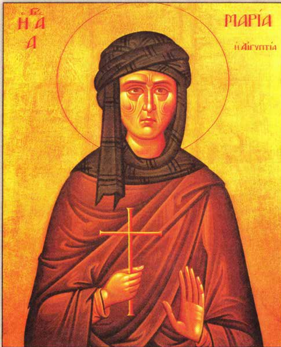
Icon of Saint Mary of Egypt