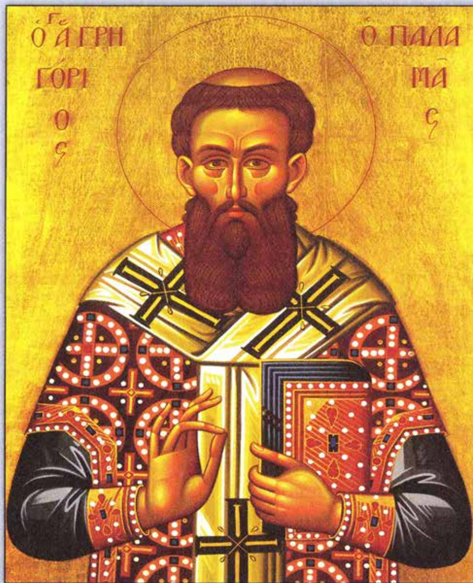
Icon of Saint Gregory Palamas